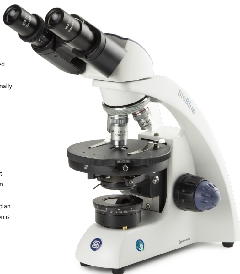
● Polarization model BB.4260-P-HLED

APL is a revolutionary paint treatment applied to the most critical parts of our products. A microscope with APL will restrict the growth of micro-organisms, including bacteria and mold