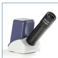
Digital monocular head