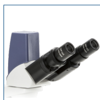
Digital binocular head