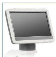
Digital LCD head