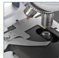
Scratch resistant stage