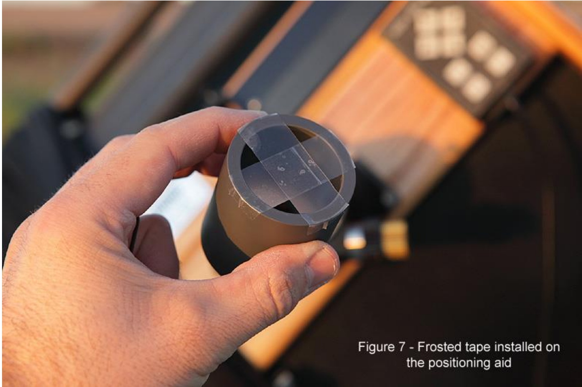
Figure 7 - Frosted tape installed on the positioning aid