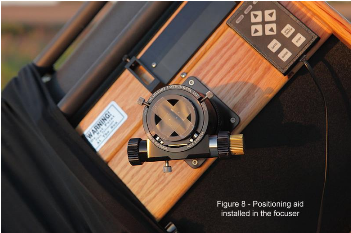
Figure 8 - Positioning aid installed in the focuser