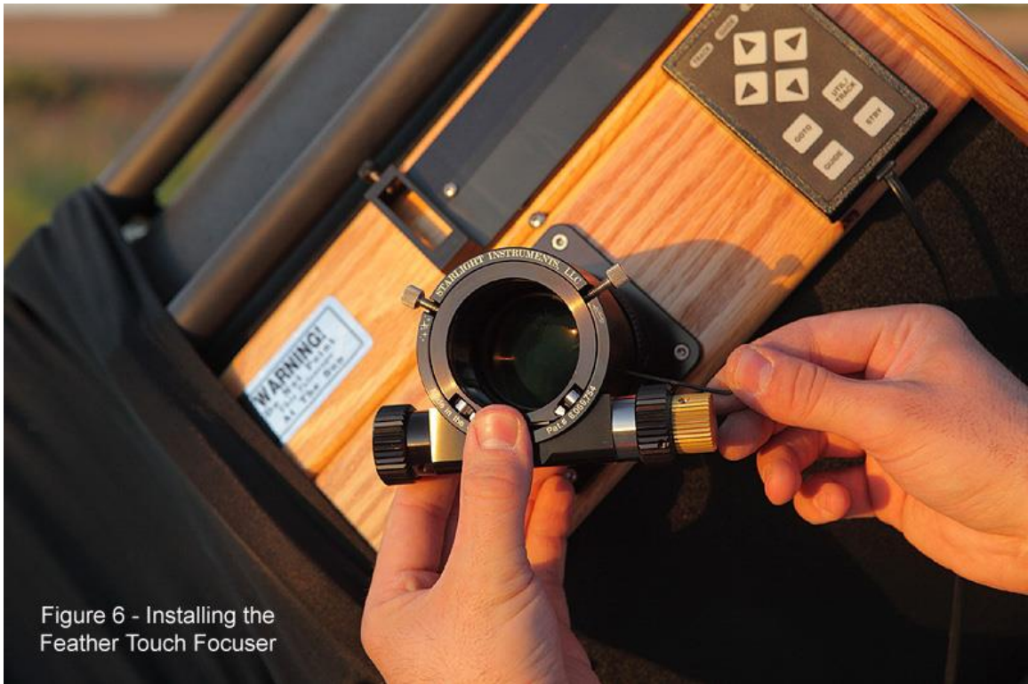
Figure 6 - Installing the Feather Touch Focuser