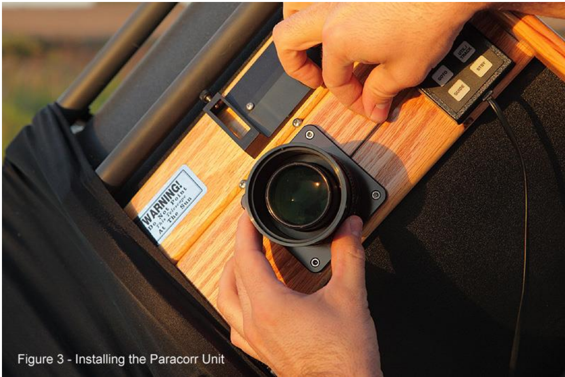
Figure 3 - Installing the Paracorr Unit